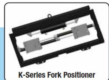
K-Series Fork Positioner