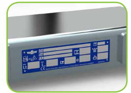
Clearly marked rating plate