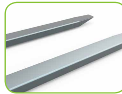
Zinc plated finish