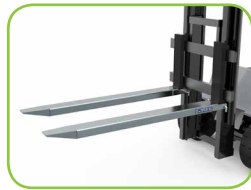
Slim profile design