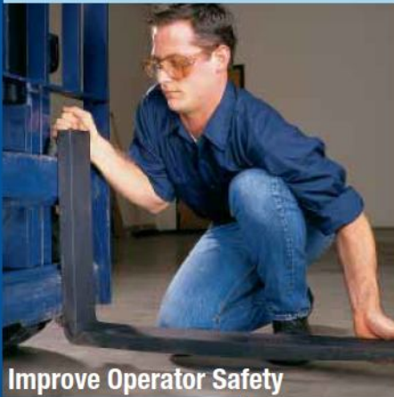
Improve Operator Safety